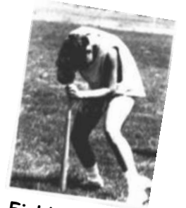
Field Day Fun?